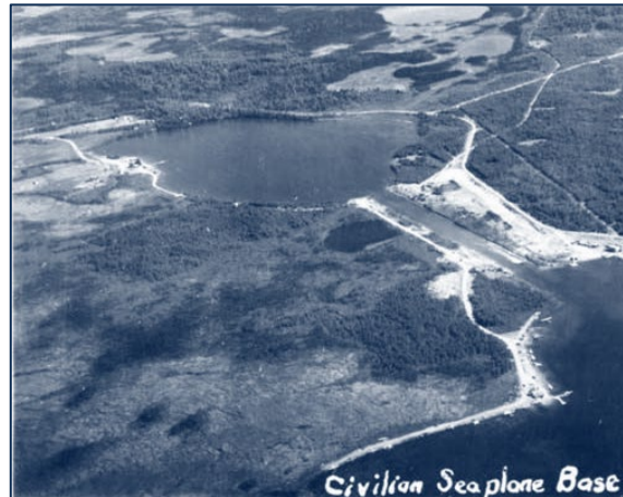
Lake Hood and Lake Spenard Canal, 1939

Today, Lake Hood has three waterways and a gravel runway. About 500 floatplane slips and 500 tie-downs at the gravel runway contribute to Lake Hood's status as the busiest seaplane base in the world, with a 13-year waiting list for floatplane slips, and a three-year wait for tie-down spots.