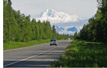
View of Mt. McKinley from the Parks Highway State Scenic Byway, 2006

The purpose of a CPP is to identify and assess key resources along a state byway and identify methods to enhance and promote those features over time. A key advantage to completing a CPP is that it enables public and non-profit organizations along the corridor to solicit Scenic Byway Grant funds for projects directly related to the byway. A CPP also enables local residents to pursue designation as a National Scenic Byway or All-American Road when and if there is strong local support.