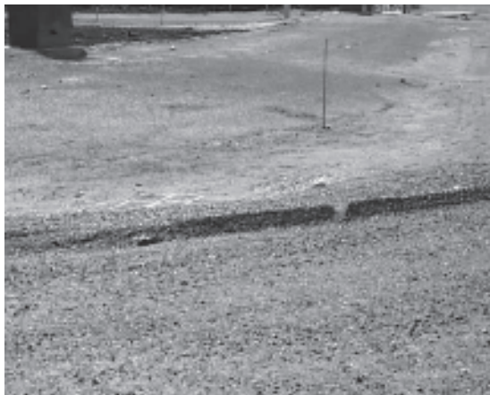
Pulling material from the shoulder of the roadway and mixing it with loose gravel on the surface works best in spring..

We also understand that truly good quality gravel is very hard to obtain in certain areas. At the very least, you should consider hauling the best materials you can