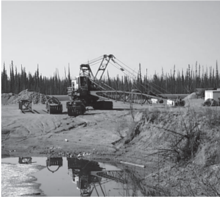
Gravel pits, like this one in Fairbanks, play an important part in obtaining good gravel.

Alaska tends to be a little unfortunate with regard to clay. While well-graded gravel can often be obtained, it usually contains very little or no clay binder. Such material tends to compact easily, but washboards rapidly. Another and very important disadvantage associated with the lack of binder is that traffic action (especially large