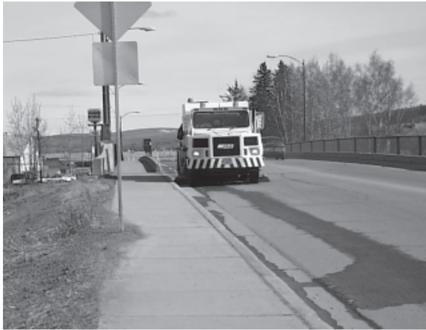
Alaska DOT&PF crews clear gravel from the Wendell Street bridge Fairbanks,

Spring brings warm weather, melting snow, mud puddles and mounds of unsightly sand and debris on our highways and sidewalks. The Alaska DOT&PF's Northern Region maintenance station in Fairbanks formulates an aggressive sweeping program for about three weeks every spring to clean transportation facilities. The sweeping activities typically start the end of April and run through the middle of May with three different crews working around the clock. Sweeping continues through