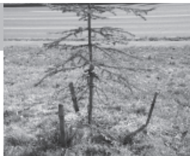
Wire ties around the trunk of this tree caused girdling.

construction projects, and the ability to do it properly is mandatory. The new Northern Region Specification requires having a certified arborist to: 1) select trees and shrubs from nurseries or tree farms; 2) supervise planting; and 3) assist with planting area maintenance. A full copy of the specifications is available from Grant Lewis, Northern Region Contracts Engineer, (907) 451-2320; or contact T2 for more information. •