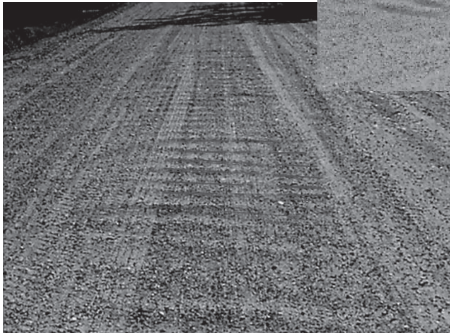
Washboards are a common problem on Branch Road in North Pole, AK.

There are several things to consider in determining quality. Washboarding will almost certainly develop if the surface gravel has poor gradation, little or no binding characteristic, and a low percentage of fractured stone.