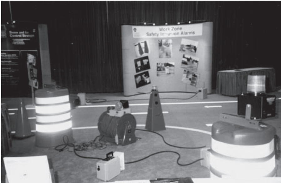
The Traffic Management Systems model is mounted on the traffic drums. The Central Security model is shown nearest the bottom of the picture, and the Watchdog model is near the center. The tall unit with the light on top is the receiver for the newest ASTI model. The two units nearest the display panel are the Safe-Lite models.

more reliable and easier for workers to use by features like solar panels to keep batteries charged. The second and most disappointing finding was that workers were generally not interested in using the devices. The one exception was the use of the microwave unit that has the built-in radar drone to activate all radar detectors of passing vehicles. Workers liked this unit and could note the slower speed of traffic. The key operational problem on the large interstate pavement rehabilitation project was that construction traffic kept actuating the units, resulting in false alarms. However, on this same project one subcontractor responsible for the bridge deck rehabilitation work liked the units. This was possibly because two workers on a similar bridge work project were killed by an out-of-control truck in