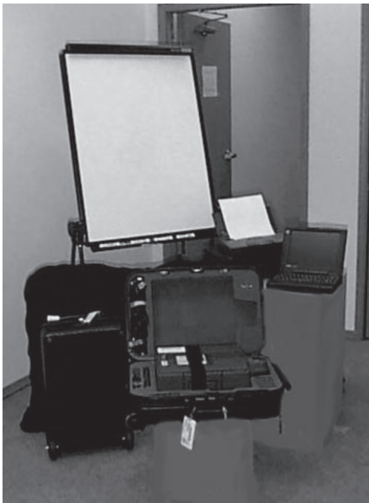
A prepared presenter may travel with a laptop, portable printer, flip chart, or multimedia projector like these available from the Alaska T2 center.

There are many advantages to delivering an electronic slide show or interactive multimedia presentation from a computer you carry with you. First and foremost, an electronic presentation is a powerful communication medium because it combines text, color, animation and graphics to visually enhance your message. Second, carrying an electronic presentation on your notebook means it can be changed in your hotel room the night before your speech, if necessary. That's something that can't be done with 35mm slides or overhead transparencies. Finally, an electronic presentation suggests you are a cut-