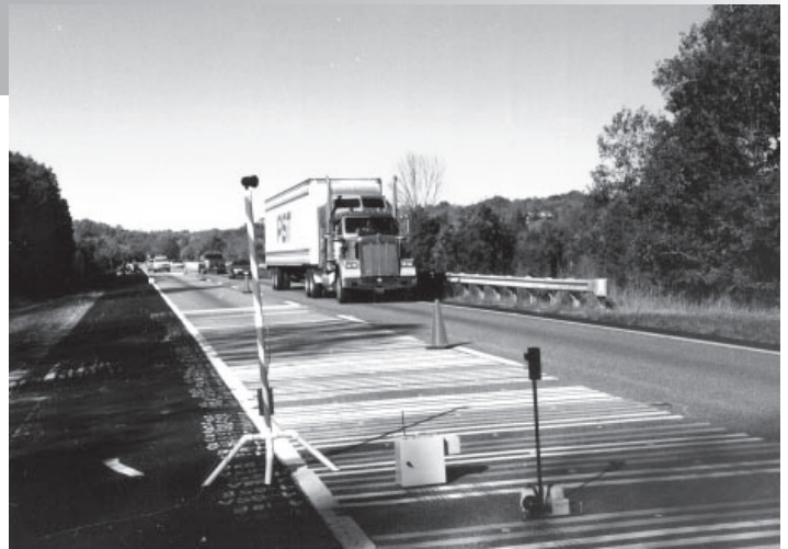
Intrusion alarms protect a crew evaluating pavement line stripes. The left alarm is the Columbia model, the middle is the Safe-Lite model, and the right is the ASTI model. These are all receivers (the transmitters are 300 feet up-stream).

From all of these results, it is generally concluded that more promotional work needs to be done with high-