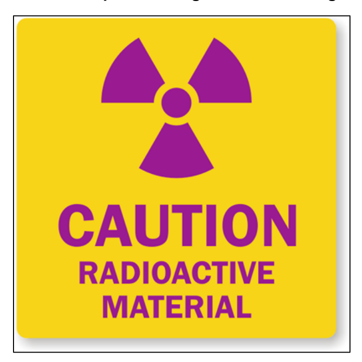
Use this sign at the entrance to all storage areas