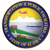
Alaska Department of Transportation and Public Facilities

AASHTO would like to thank the following conference sponsors for their generous contributions to this meeting: