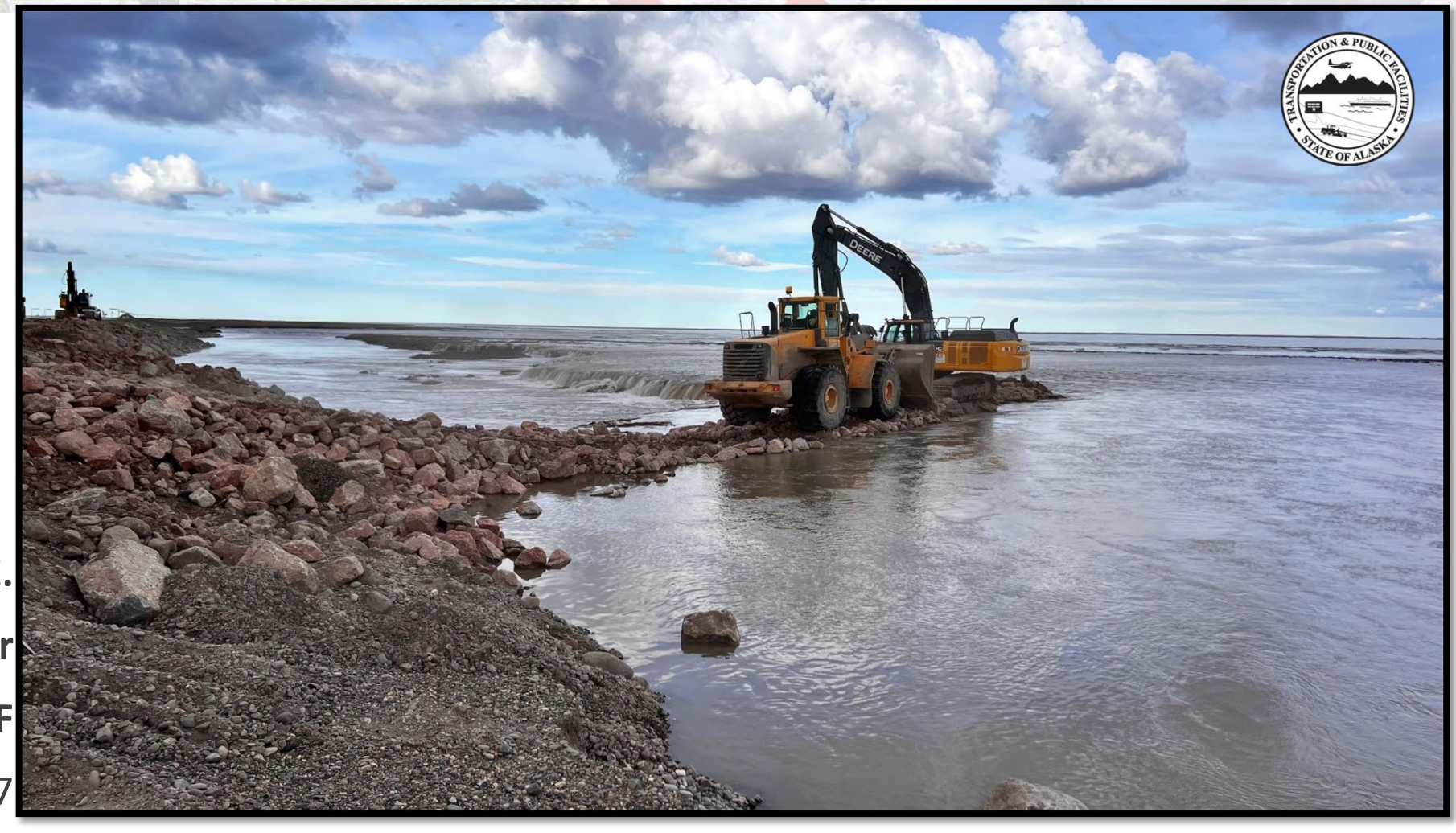
Repair work at Sagavanirktok River washout along the Dalton Hwy, 2023.