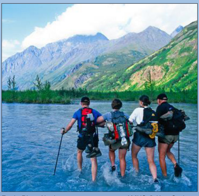
Eagle River Alaska