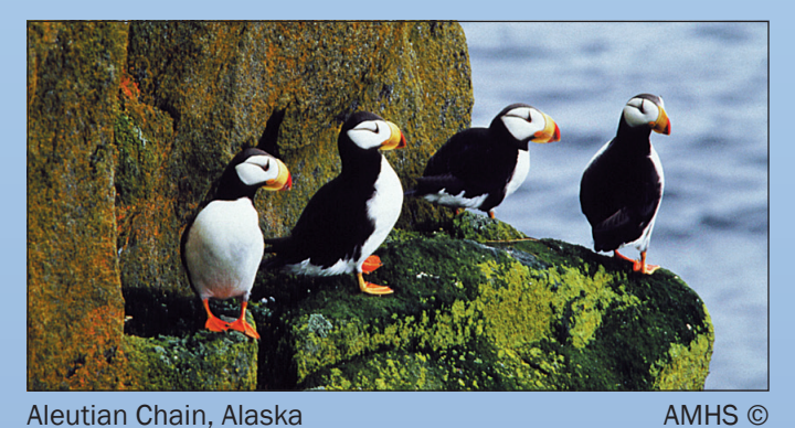
Aleutian Chain, Alaska