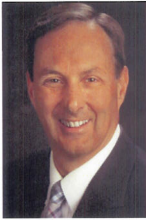
CRAIG E. CAMPBELL Lieutenant Governor

In July 2009, Craig E. Campbell was appointed lieutenant governor for the State of Alaska.